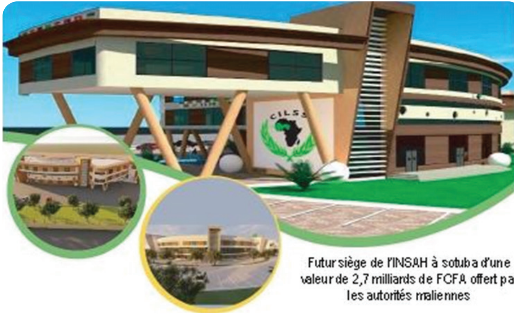
Futur siège de l'INSAH à Sotuba d'une valeur de 2,7 milliards de FCFA offert par les autorités maliennes

1ère Conférence Internationale sur les Marchés et l'Intégration Régionale au Sahel et Afrique de l'Ouest